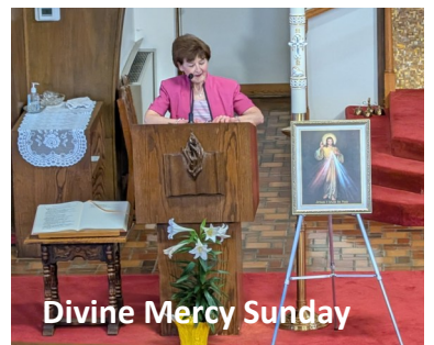
Divine Mercy Sunday

Christ the King Church 123 Good Street · Houtzdale, PA 16651