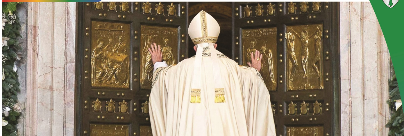
Pope Francis opens the Holy Door of St. Peter's Basilica to inaugurate the Jubilee Year of Mercy at the Vatican in this file photo from Dec. 8, 2015.

Welcome to the Jubilee Journey: Pilgrims of Hope monthly newsletter. Join us each month for ways to stay connected and to celebrate this Holy Year.