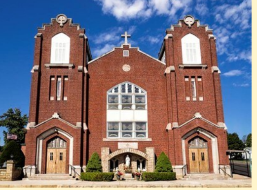
Immaculate Conception Mission Church 408 Stone Street · Osceola Mills, PA 16666

Christ the King Church 123 Good Street · Houtzdale, PA 16651