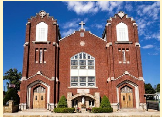
Immaculate Conception Mission Church

408 Stone Street · Osceola Mills, PA 16666