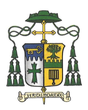
January 6, 2025