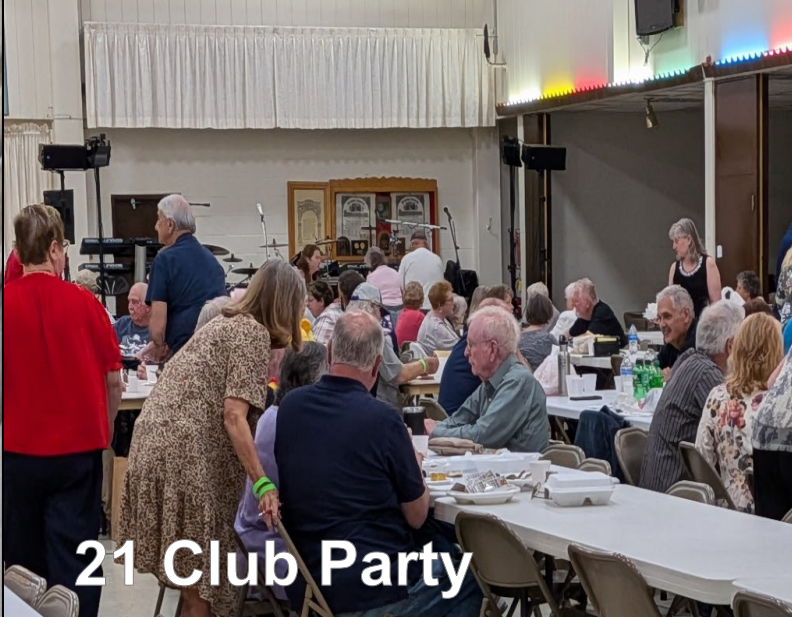
21 Club Party