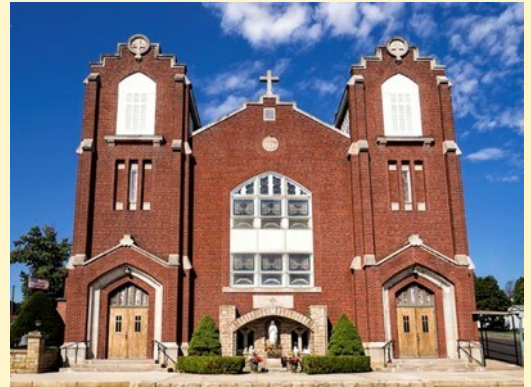
Immaculate Conception Mission Church

408 Stone Street · Osceola Mills, PA 16666