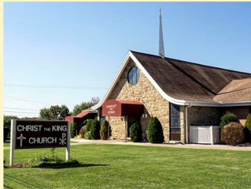
Christ the King Church