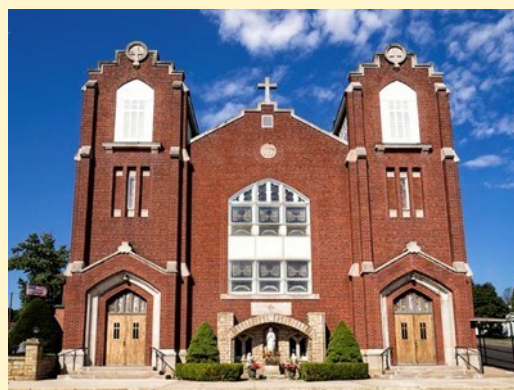
Immaculate Conception Mission Church

408 Stone Street · Osceola Mills, PA 16666