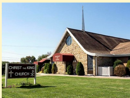
Christ the King Church