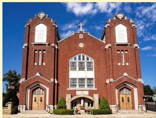
Immaculate Conception Mission Church

408 Stone Street · Osceola Mills, PA 16666