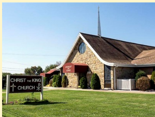
Christ the King Church