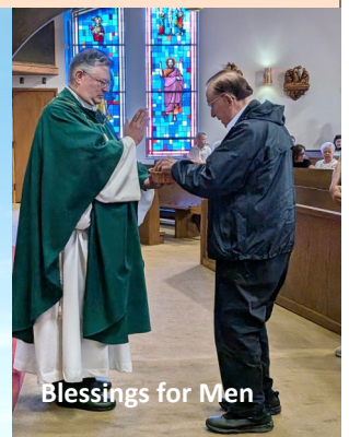
Blessings for Men