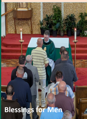
Blessings for Men

Contact any Fundraising Committee Member, K of C Member or the parish office to purchase a ticket.