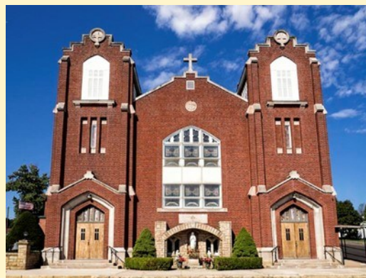
Immaculate Conception Mission Church

408 Stone Street · Osceola Mills, PA 16666