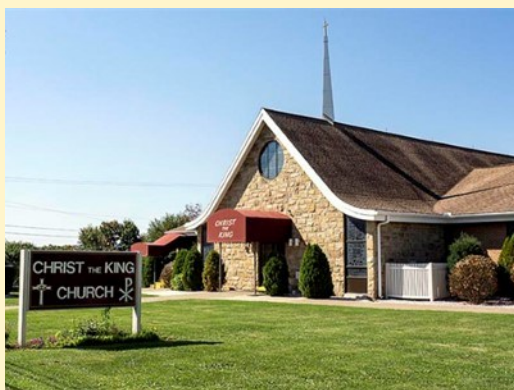
Christ the King Church