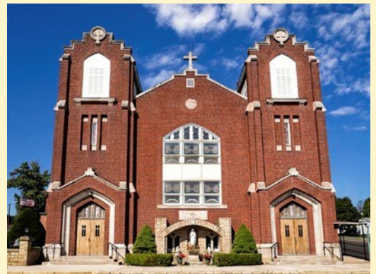
Immaculate Conception Mission Church

408 Stone Street · Osceola Mills, PA 16666