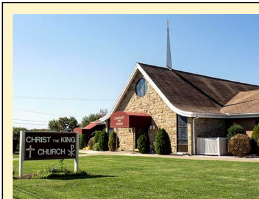
Christ the King Church