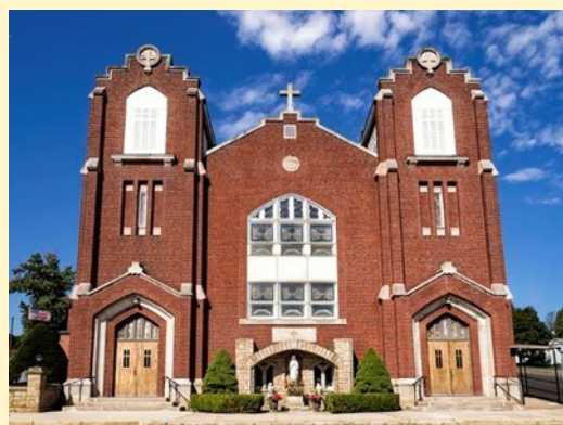
Immaculate Conception Mission Church

408 Stone Street · Osceola Mills, PA 16666