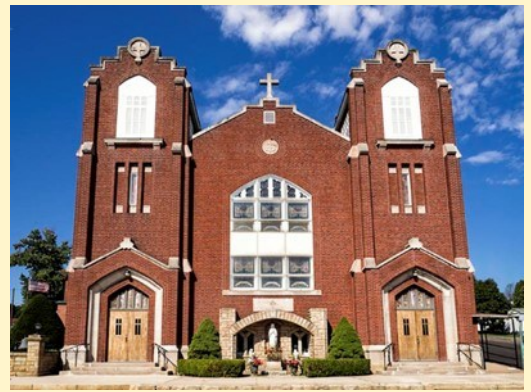
Immaculate Conception Mission Church

408 Stone Street · Osceola Mills, PA 16666