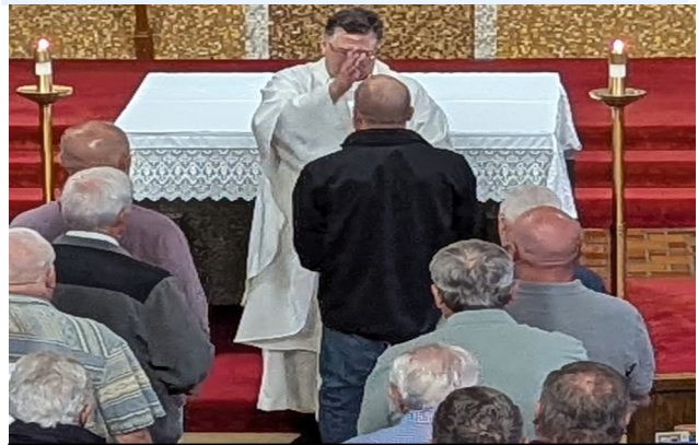
Fathers at Christ the King Parish received a special blessing during the 10 a.m. Mass Sunday on Father's Day.

Next week we will take up the Peter's Pence Collection to support the Universal Church and the work of the Holy See, including the charitable works of Pope Leo XIV. These works benefit our brothers and sisters on the margins of society, including victims of war, oppression, and disasters. Please be generous. For more information visit www.obolodisanpietro.va/en.html .