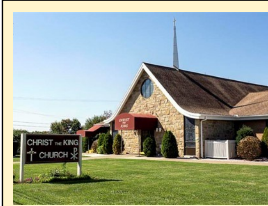
Christ the King Church