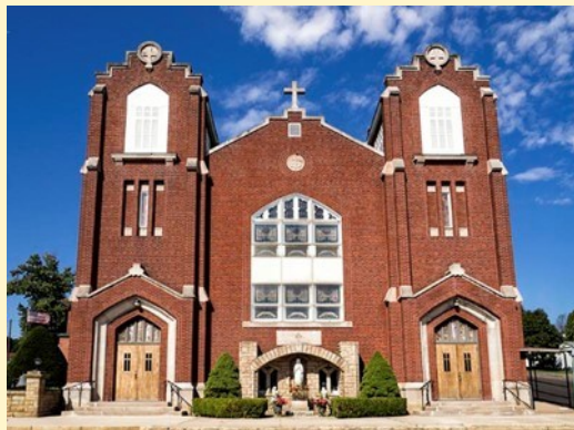
Immaculate Conception Mission Church

408 Stone Street · Osceola Mills, PA 16666