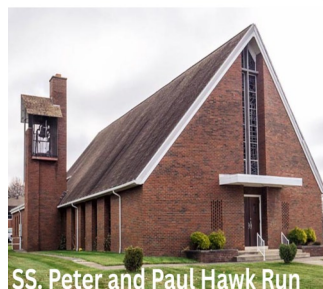
Ss. Peter and Paul Hawk Run