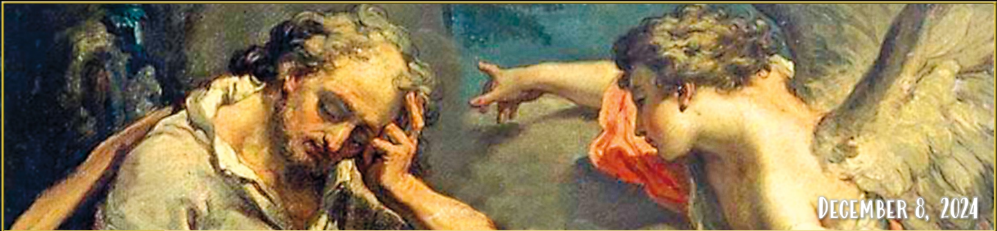
Joseph's Dream (1790) - Gaetano Gandolfi

...all flesh shall see the salvation of God.