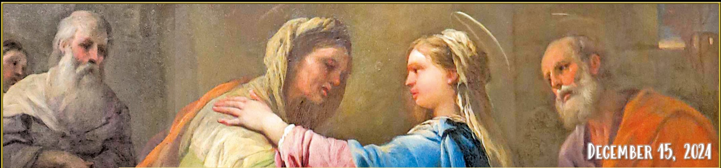
The Visitation (1696) - Luca Giordano

He will baptize you with the Holy Spirit. Lk 3:16