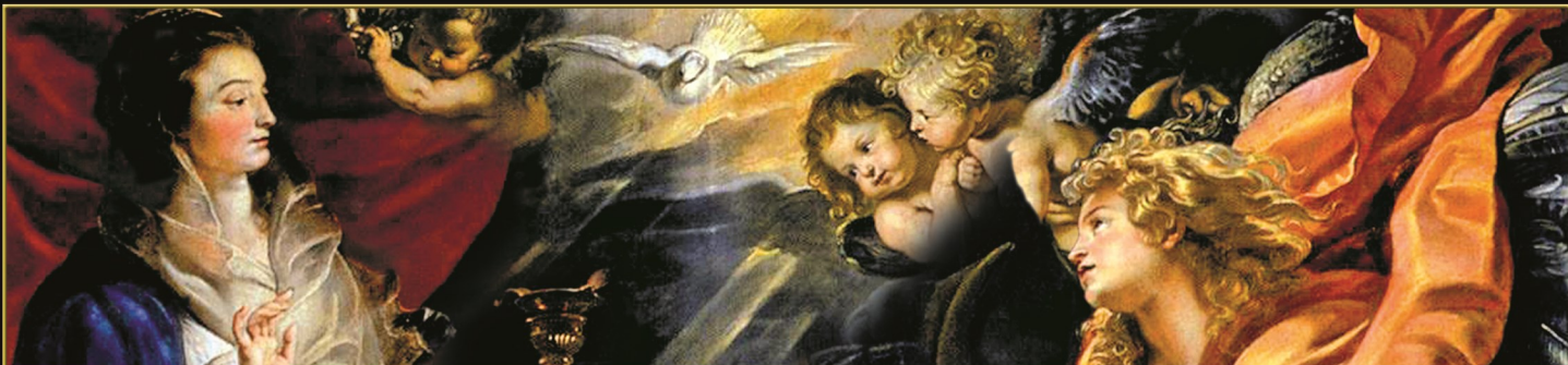
The Annunciation (1610) - Peter Paul Rubens