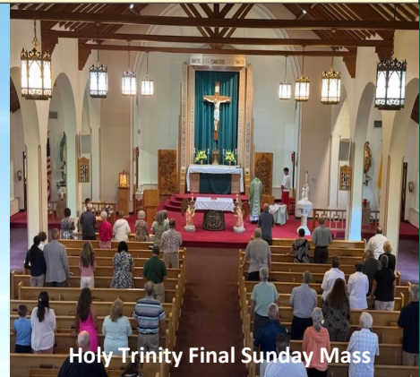
Holy Trinity Final Sunday Mass

1st Monday of the month: 5:30 p.m. 3rd Monday of the Month: 5:30 p.m.