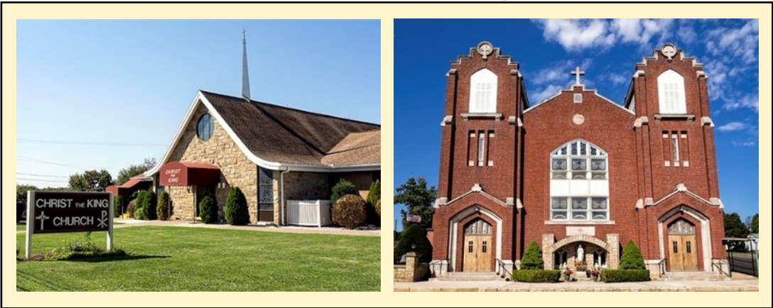
Christ the King Church 123 Good Street · Houtzdale, PA 16651