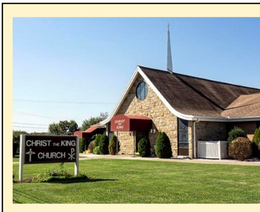
Christ the King Church