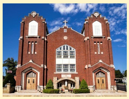
Christ the King Church