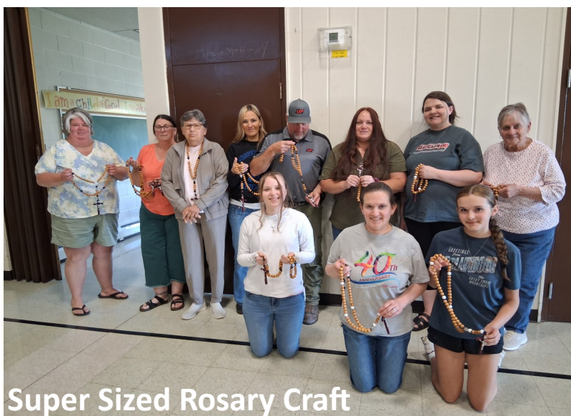
Super Sized Rosary Craft

Christ the King Church 123 Good Street · Houtzdale, PA 16651