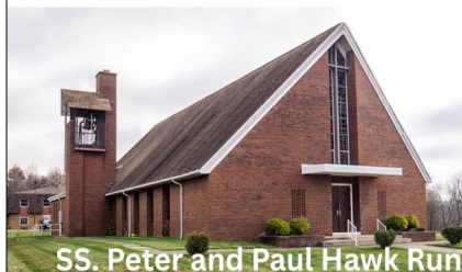
Ss. Peter and Paul Hawk Run