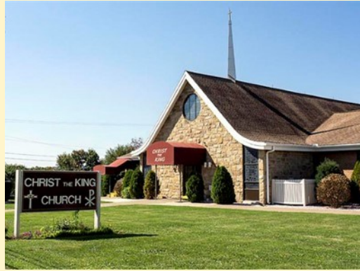
Christ the King Church