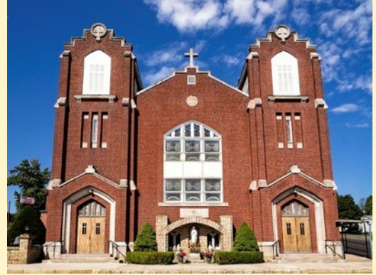
Immaculate Conception Mission Church

408 Stone Street · Osceola Mills, PA 16666