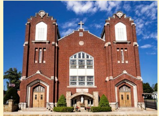
Immaculate Conception Mission Church

408 Stone Street · Osceola Mills, PA 16666