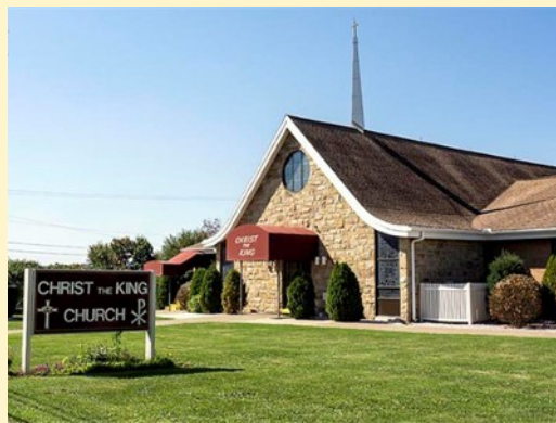
Christ the King Church