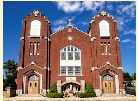
Immaculate Conception Mission Church

408 Stone Street · Osceola Mills, PA 16666